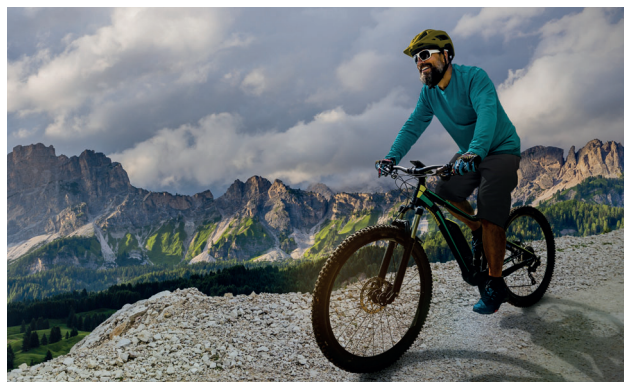
E-Bikes and Pedelecs