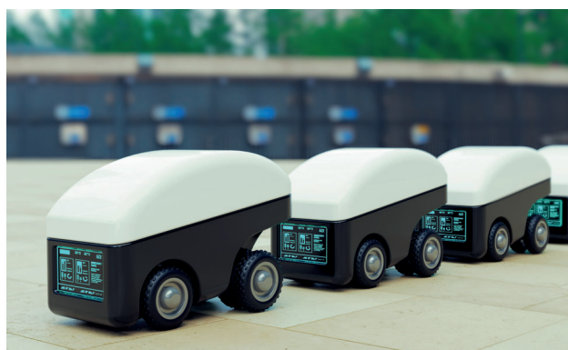
Last Mile Logistics