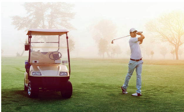
Golf caddies and trolleys